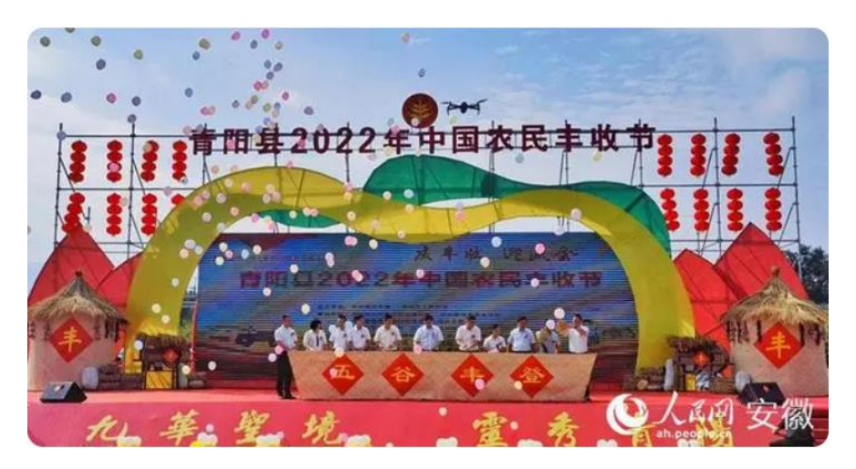
Annual representative event: 2022 Chinese Farmers' Harvest Festival in Qingyang County