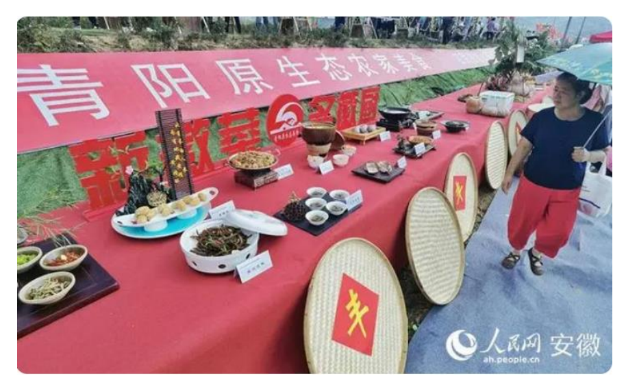
Annual representative event: High-quality agricultural products exhibition in 2022 Chinese Farmers' Harvest Festival