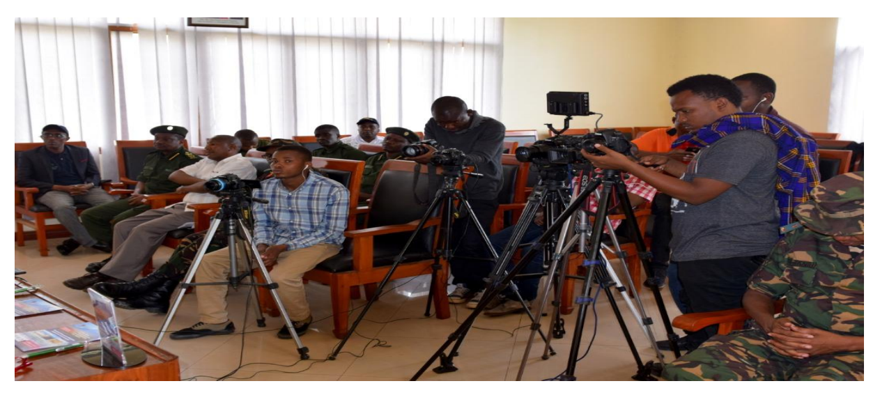
Figure 1: Press release during announcement about 60 years of Zinj Celebration

Number of Geopark press release: Number of press conference release conducted related to the geopark activities. The first press held when announcing about celebration of 60 years since discovery of Zinj skull and other hominids.