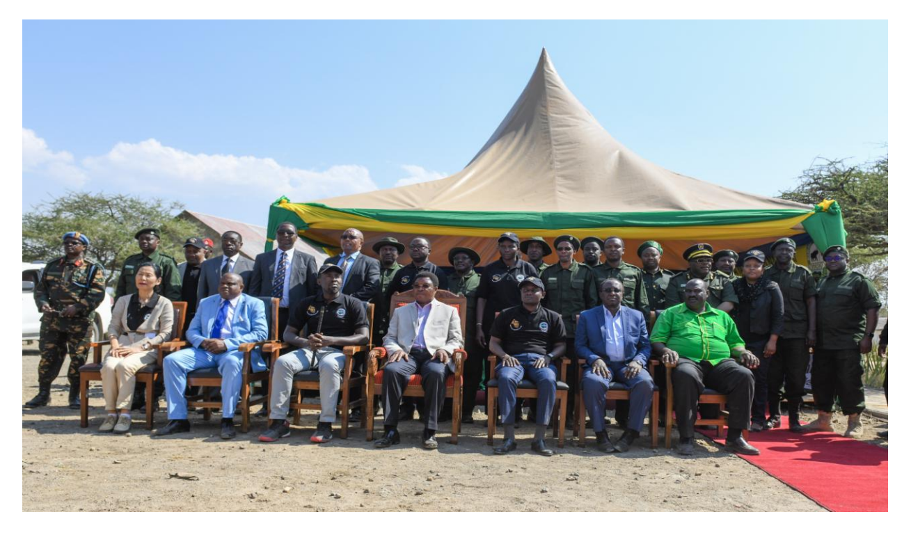
Figure 3: Group photo after the events at Mary Leakey living museum one of the Geopark sites in Ngorongoro Lengai Geopark.