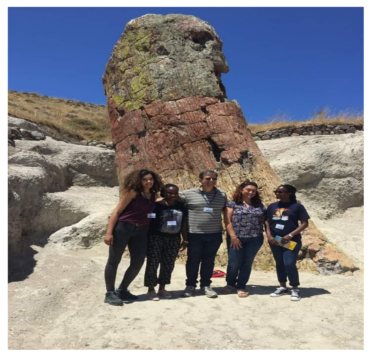
Figure 8: Group picture during field trip at Lesvos Petrified Forest in Greek.