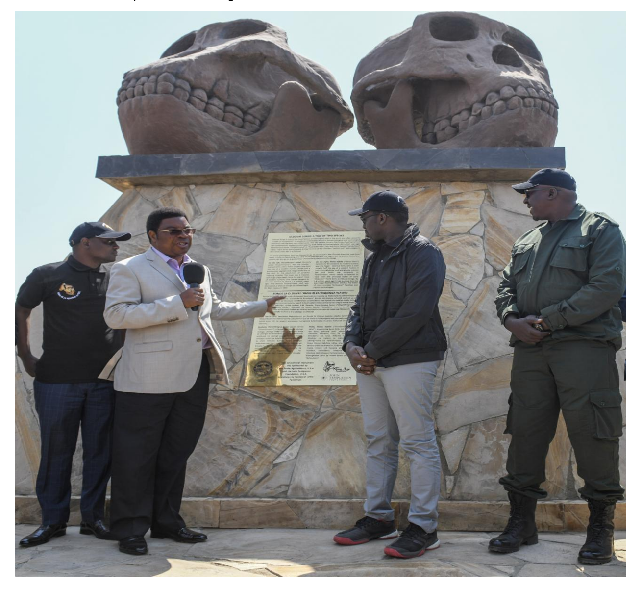
Figure 1: Hon. PM Kasim Majaliwa and Ministry of Natural Resources and Tourism Hon. Hamis Kigwangwala during Celebration of 60s years of Zinjathropus at Ngorongoro of which its one of the Ngorongoro Lengai attractions

Celebration of Zinj Day known as Zinjanthropus Boisei, the skull of the earliest man, at Olduvai Gorge July, 2019. Local community and students participated in the event aimed at providing awareness on our precious heritage.