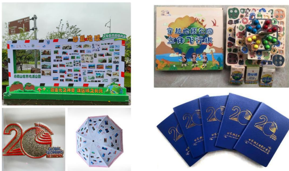
20 th Anniversary Cultural and Creative Products

(3) Initiated the 20th Anniversary Commemoration Theme Event of the GGN. Co-hosted the GGN 20th anniversary event with the first 8 Chinese UGGps, including Huangshan UGGp, Zhangjiajie UGGp, Lushan UGGp, Yuntaishan UGGp, Shilin UGGp, Songshan UGGp, Wudalianchi UGGp, and 47 other Chinese UGGps, including Yandangshan UGGp.