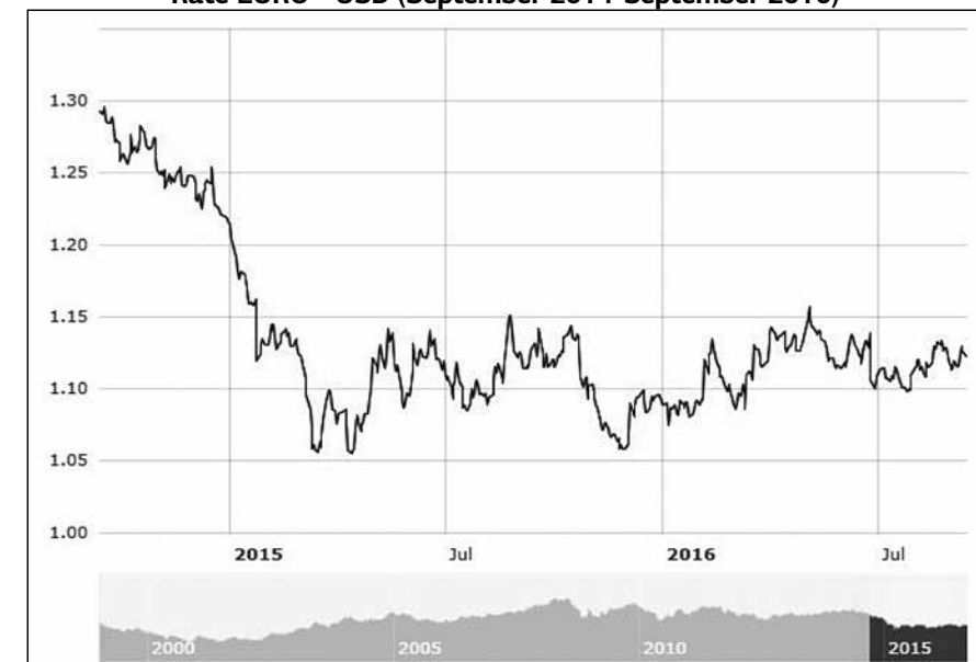
ANNEX 1 Rate EURO - USD (September 2014-September 2016)

During the last two years the rate has dramatically changed. At the day of the previous budget approval it was 1€ = 1.0635 USD (17/03/2015 European Central Bank) while the rate at the day of the GGN General Assembly was 1€ = 1.2852 USD (19/09/2014 European Central Bank).