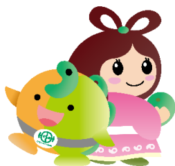
Itoigawa Geopark Mascot Characters GeoMaru & Nuna